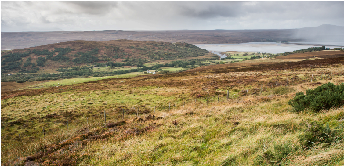
Near Tongue